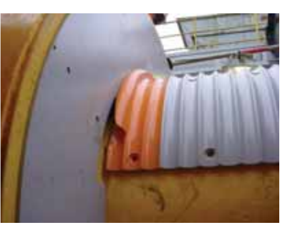
Welding or bolting a grooved sleeve onto a smooth drum can be a cost-effective alternative to total drum replacement