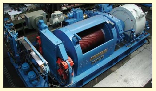
A Wirth GH 3000 draw-works, similar to – but half the power of – the new GH 6000 that is now being developed

The winch drum has a pitch circle diameter of 1259mm on the first layer and it is 2400mm long between the flanges. It holds 840 metres of 17/8 inch (47.6mm) diameter wire rope in four layers.