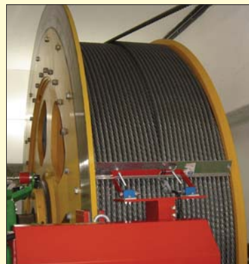
The 4100mm diameter drum for the new Lauterbrunnen-Grütschalp gondola

To help extend the life of the rope, the operators of the service have followed the Lebus slip-and-cut procedure.