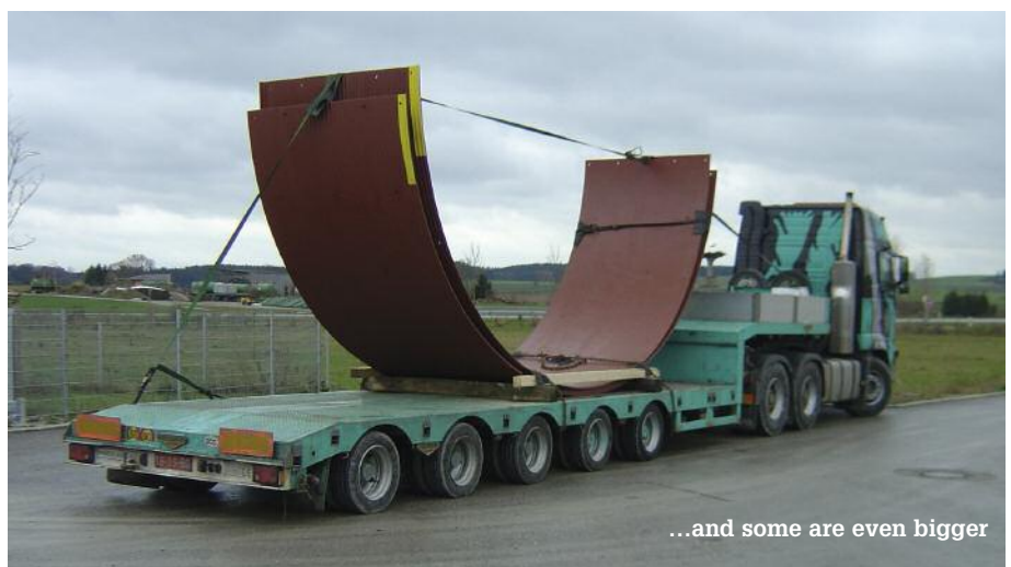
...and some are even bigger