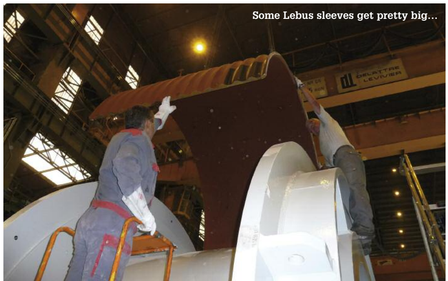
Some Lebus sleeves get pretty big...